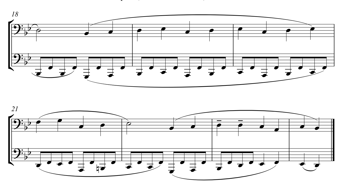
Op. 68, No. 5: Stückehen, cont.