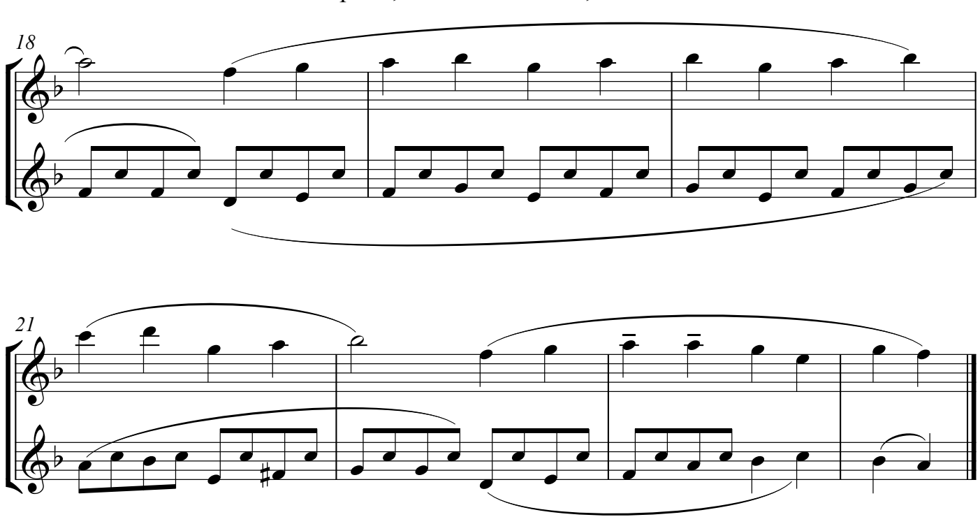
Op. 68, No. 5: Stückchen, cont.