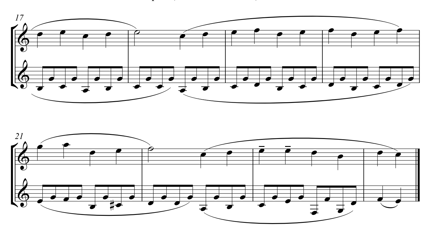
Op. 68, No. 5: Stückchen, cont.