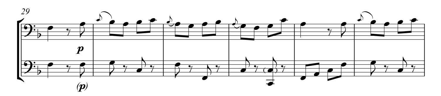
No. 12. Allegro, cont.