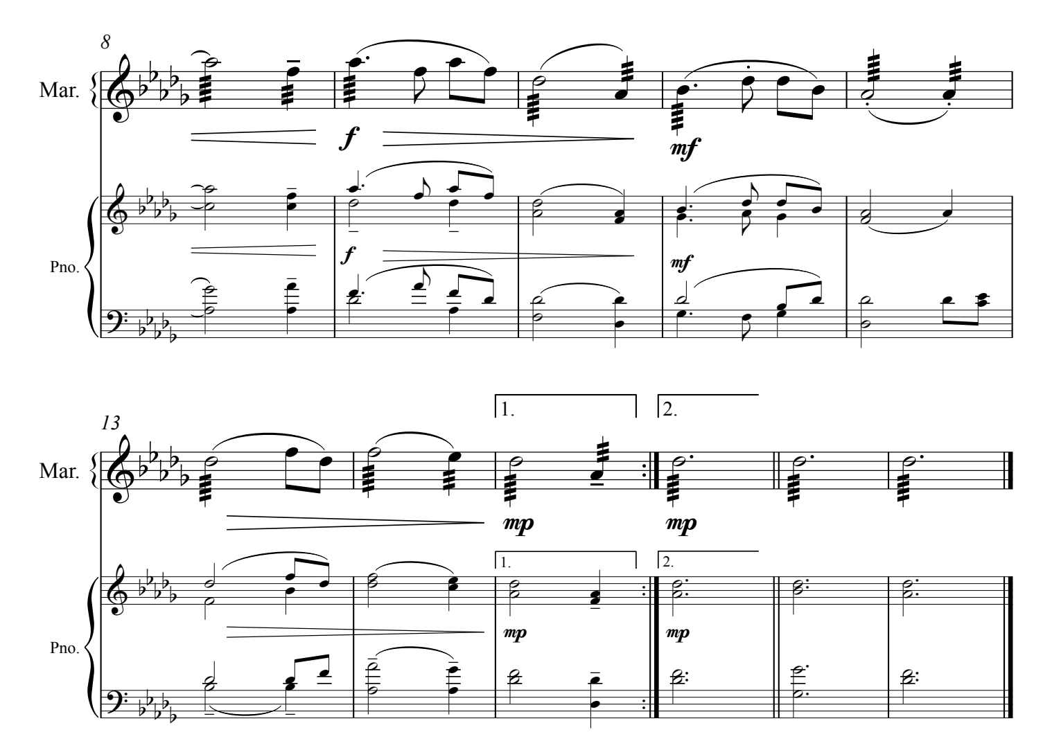
The top melody line may be omitted from the optional piano part if desired.