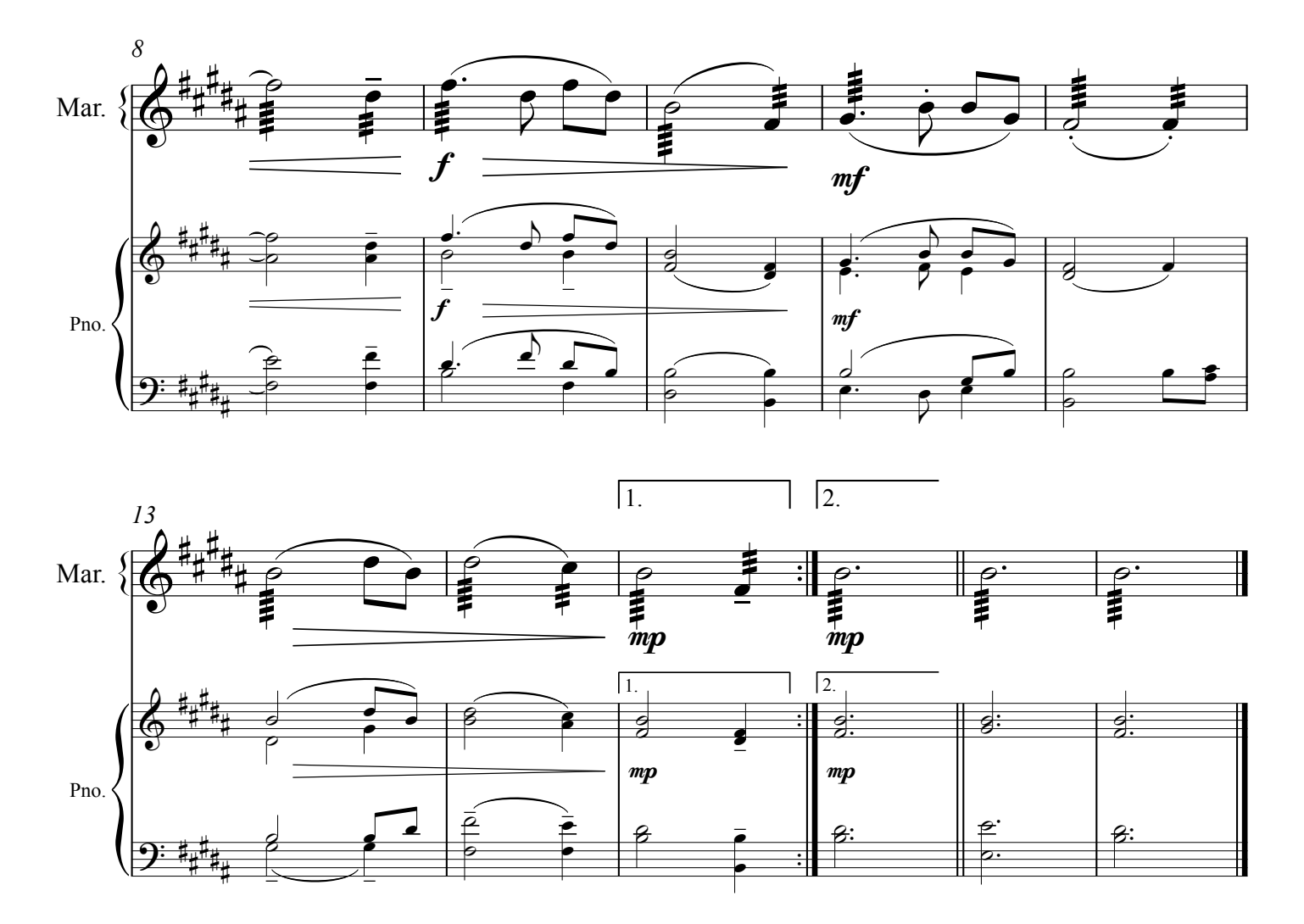
The top melody line may be omitted from the optional piano part if desired.