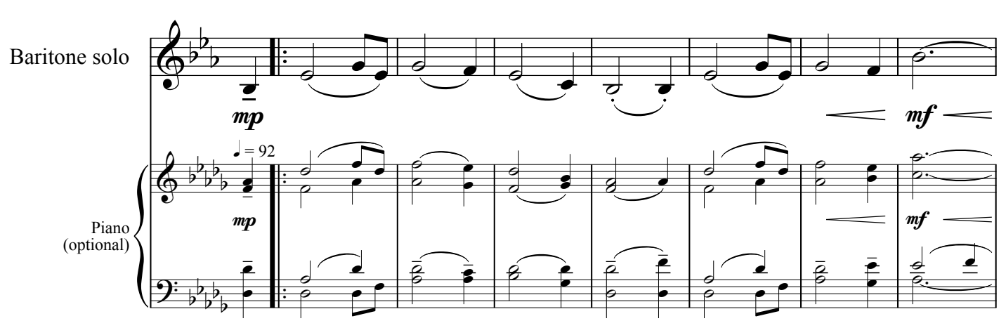
The top melody line may be omitted from the optional piano part if desired.