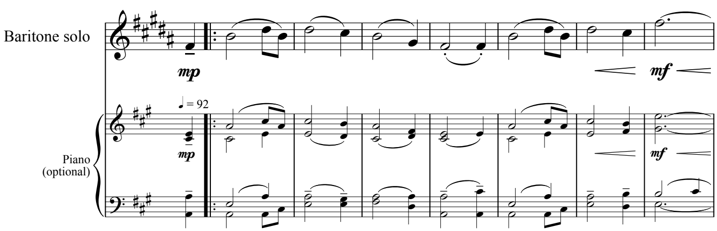
The top melody line may be omitted from the optional piano part if desired.