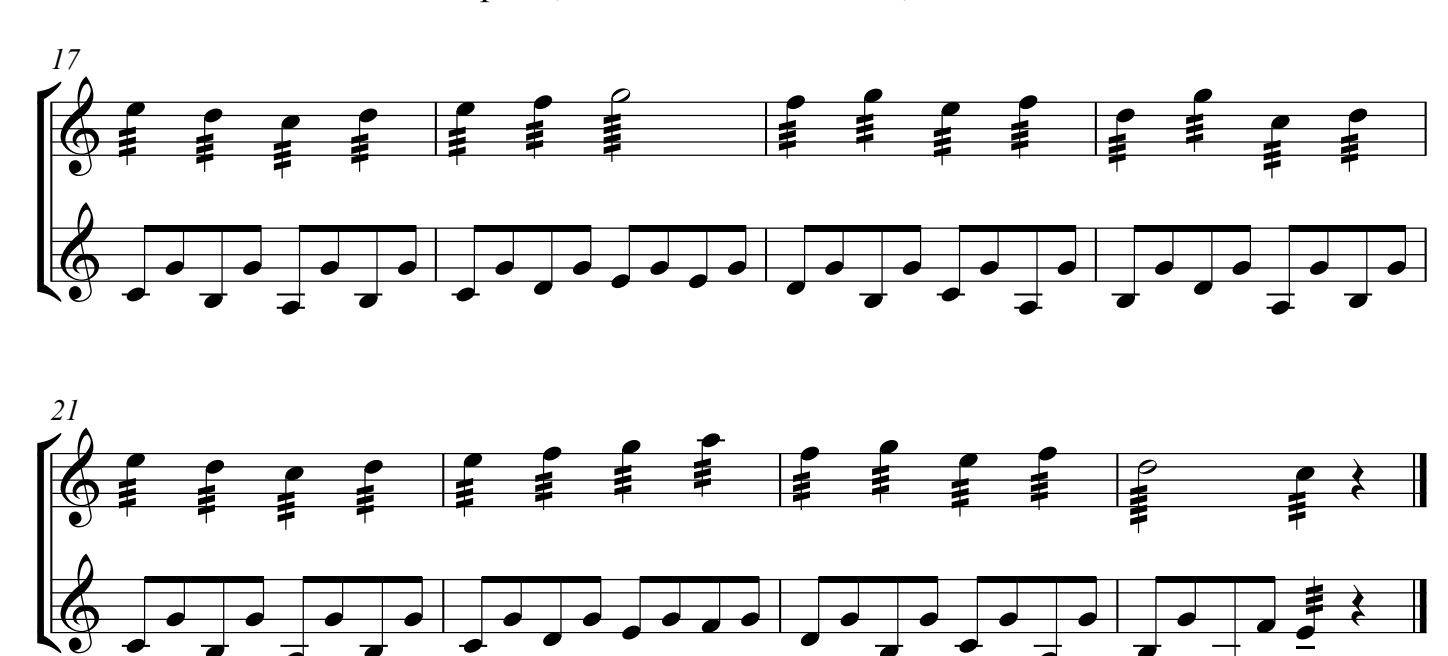
Op. 68, No. 3: Trällerliedchen, cont.