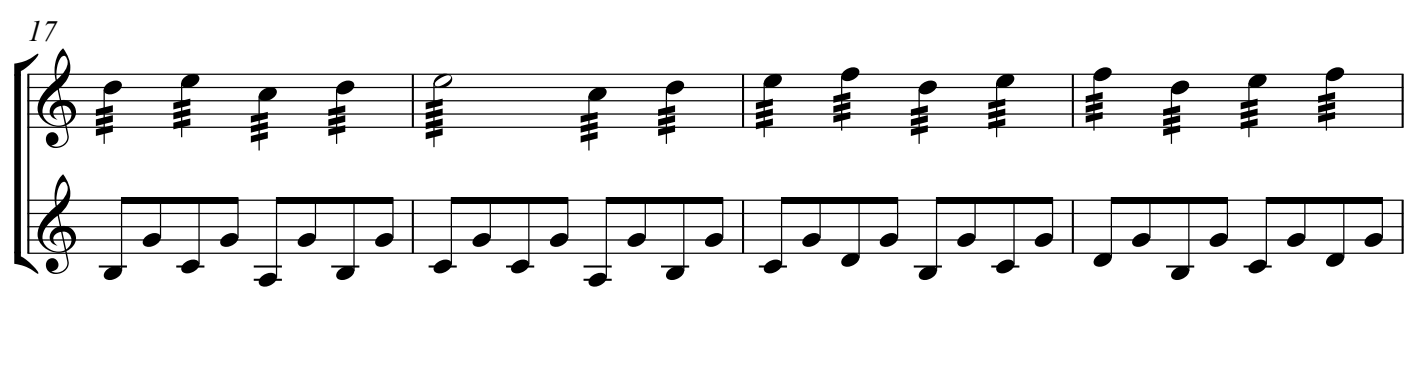
Op. 68, No. 5: Stückchen, cont.