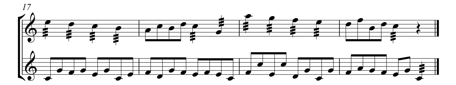
Op. 68, No. 1: Melodie, cont.