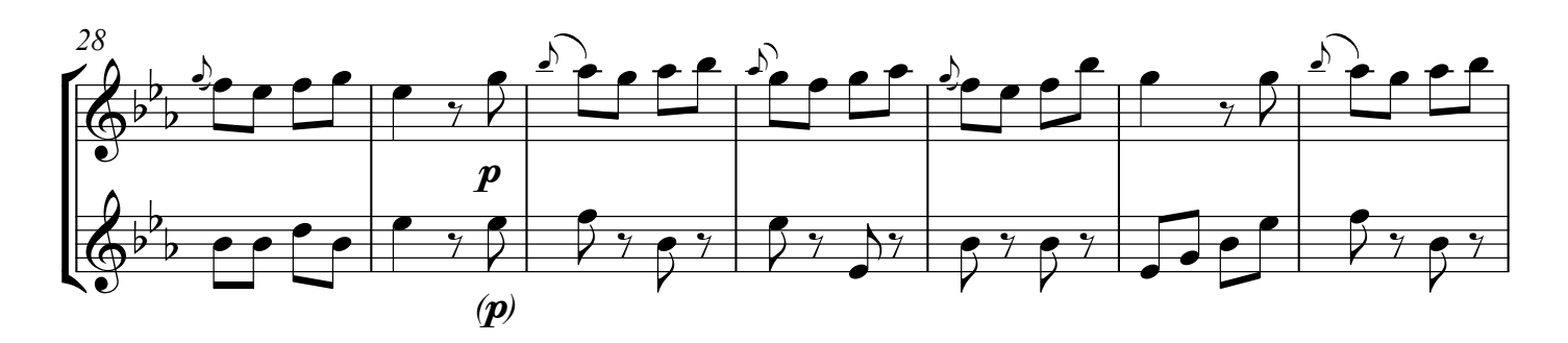
No. 12. Allegro, cont.