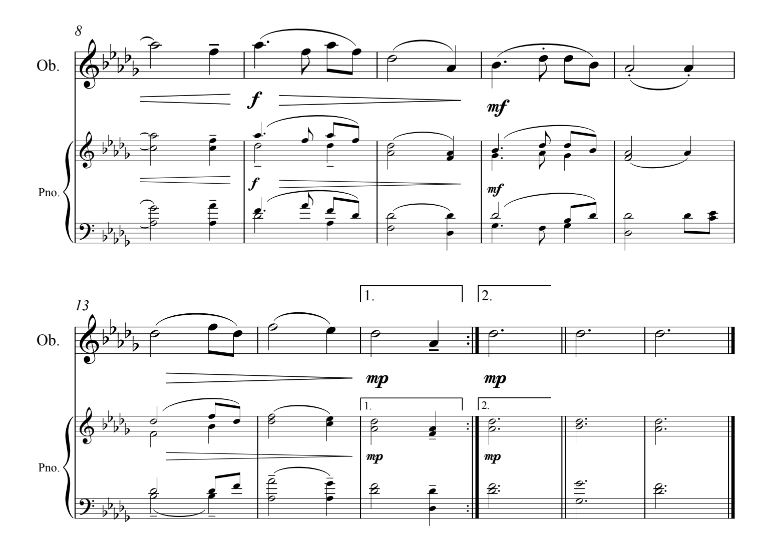
The top melody line may be omitted from the optional piano part if desired.