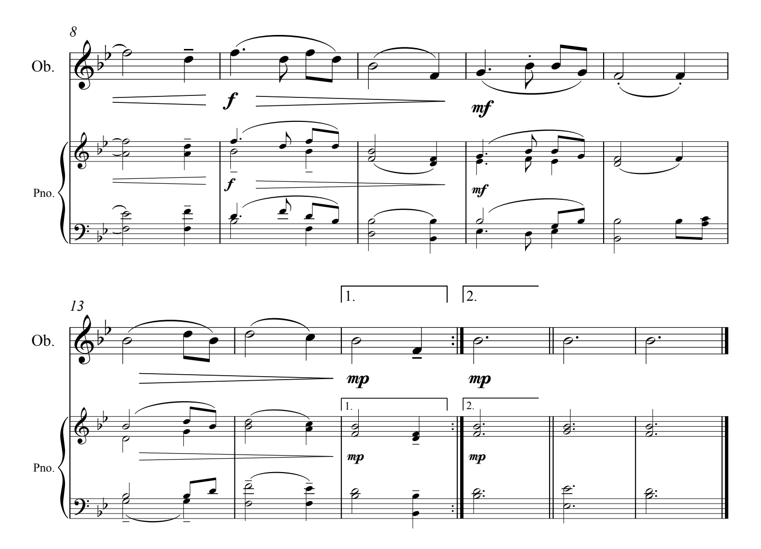
The top melody line may be omitted from the optional piano part if desired.