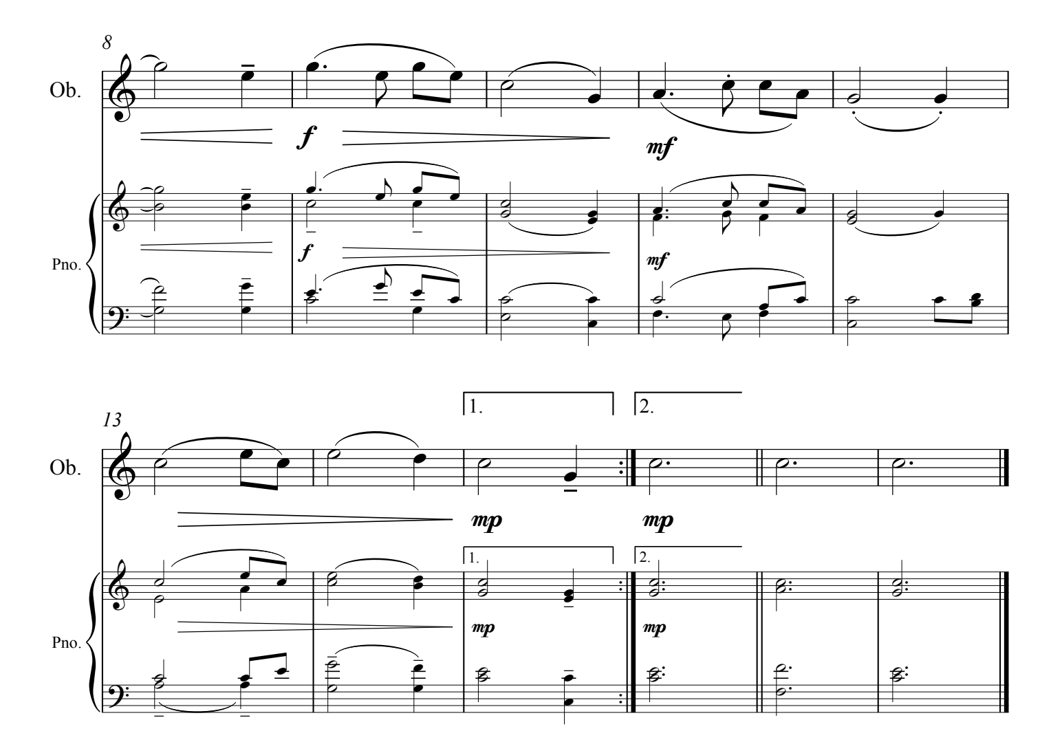
The top melody line may be omitted from the optional piano part if desired.