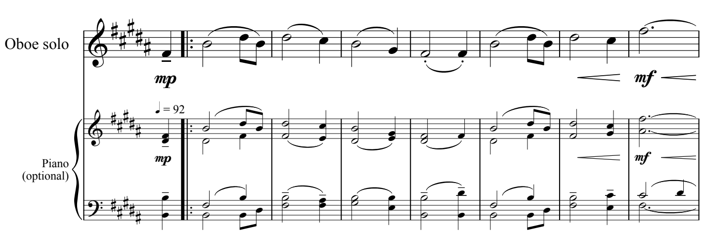
The top melody line may be omitted from the optional piano part if desired.