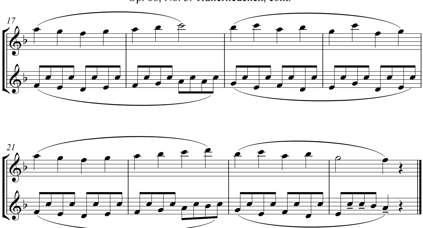
Op. 68, No. 3: Trällerliedchen, cont.